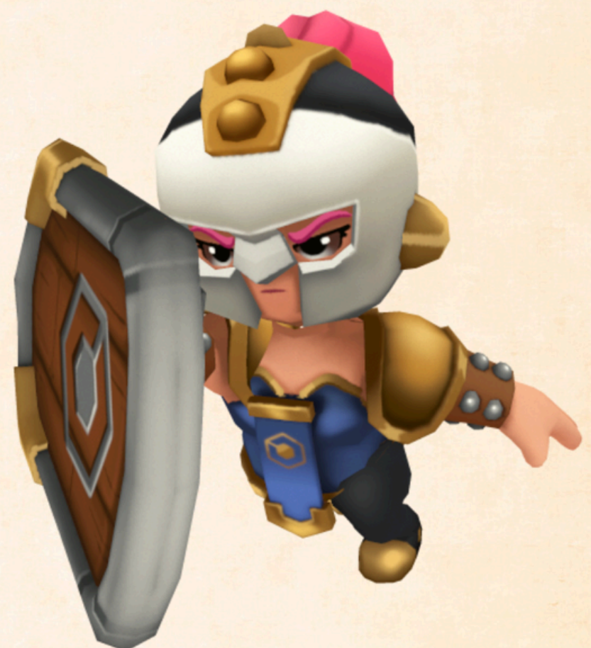
S o p h i e