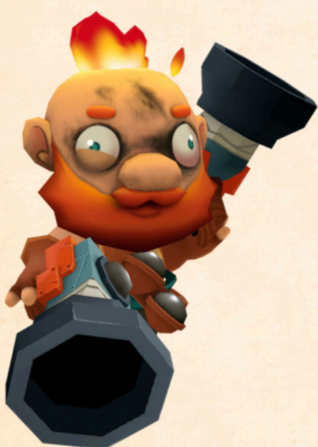
T w e e k s