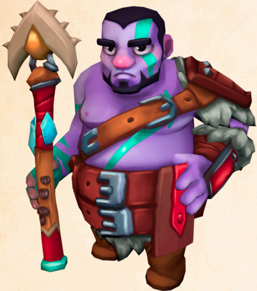
H u k